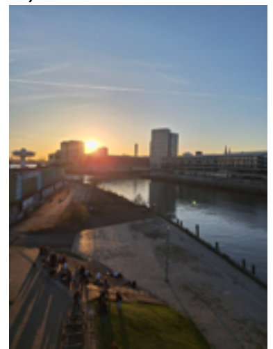
View of the Elbe and the university