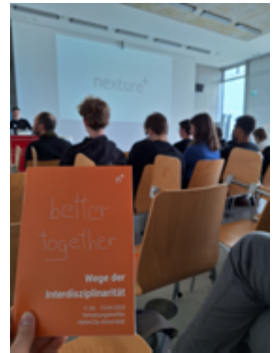
Start of the event in plenary session

There are various annual events, including the networking meeting, which this year took place at HafenCity University in Hamburg (HCU) under the motto "Paths of Interdisciplinarity".