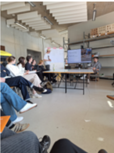
Insight into a Workshop

I arrived together with students from Darmstadt University of Applied Sciences. Once we had arrived and registered, we were given a tour of the university. On Friday evening, there was a keynote speech and a great get-to-know-you session where I got to meet lots of people.